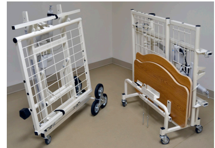
Transport Dolly and Stair Climber