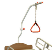
Trapeze Patient Helper